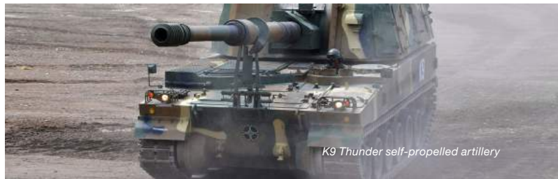
K9 Thunder self-propelled artillery

An additional artillery battalion will be established within the 2nd Infantry Brigade, which will receive a 122 mm weapons system (firing range 15 km, 22 km with special ammunition) and the necessary auxiliary vehicles.