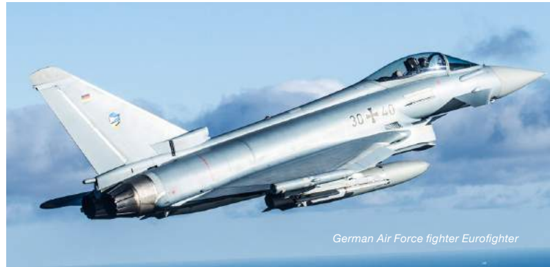
German Air Force fighter Eurofighter

The Ämari Air Base, developed in a larger than planned volume, is capable of hosting NATO Air Policing missions year-round. At any one time, Ämari Air Base hosts at least four NATO Baltic Air Policing mission fighters. Most of the allies use F-16 or Eurofighter Typhoon type fighter planes. Besides the fighter planes used for Air Policing, a number of different types of Allied aircraft train in Estonian airspace.