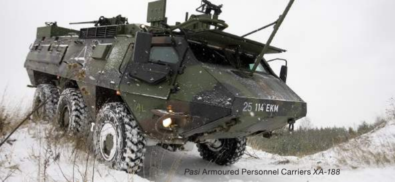
Pasi Armoured Personnel Carriers XA-188