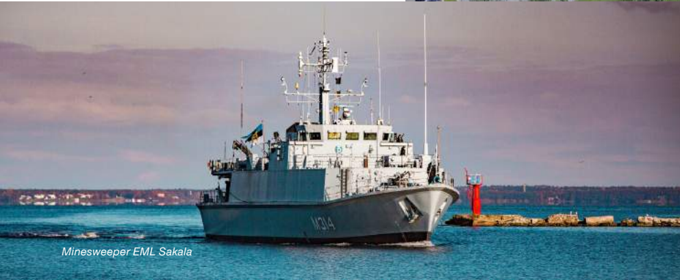
Minesweeper EML Sakala