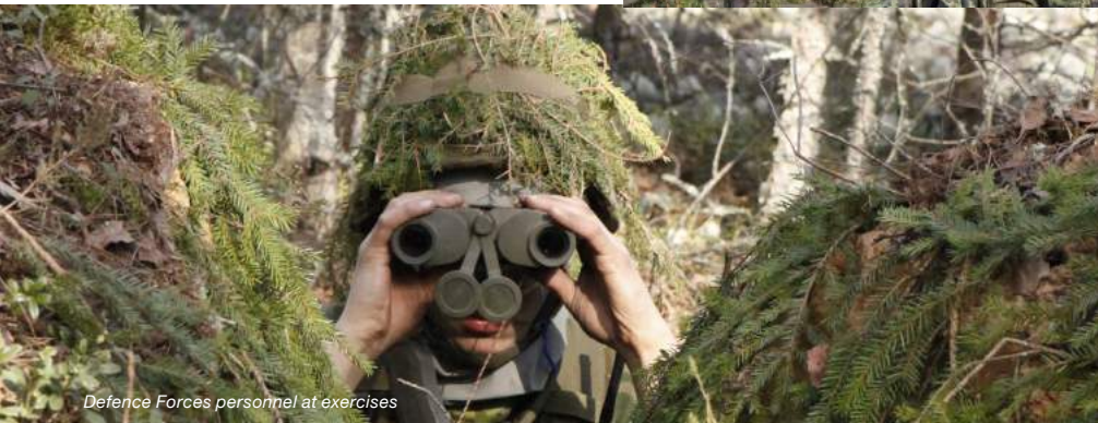
Defence Forces personnel at exercises