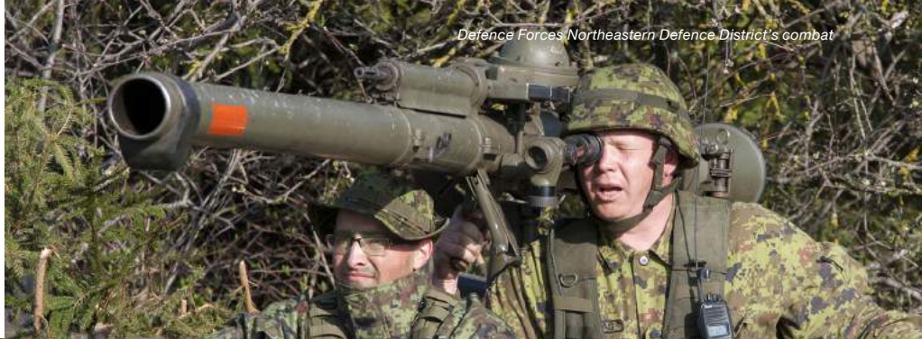
Defence Forces Northeastern Defence District's combat

Territorial defence structure will increase by more than ten light infantry companies and a thousand soldiers. Upgrading the Defence League's infrastructure will be continued to ensure the high level of training of volunteers, develop values-based education, carrying out a patriotic education programme.