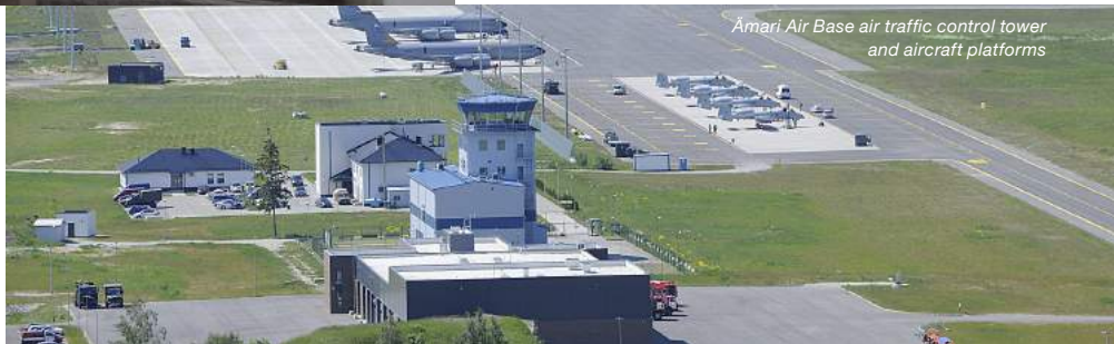
Ämari Air Base air traffic control tower and aircraft platforms

Airspace surveillance with sensors remains the main function of the Air Force. Ämari Air Base has around-the-clock, all-season readiness to host Allied fighters and transport aircraft.