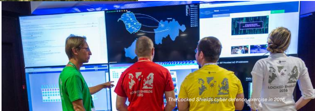
The Locked Shields cyber defence exercise in 2016

A Cyber Command will be established. The Cyber Command will achieve integration for carrying out cyber and information operations in cyberspace and the information sphere. In addition, the NATO Cyber Range will start operating in Estonia, offering NATO and Allied forces a venue for cyber defence exercises, training and testing of IT systems.