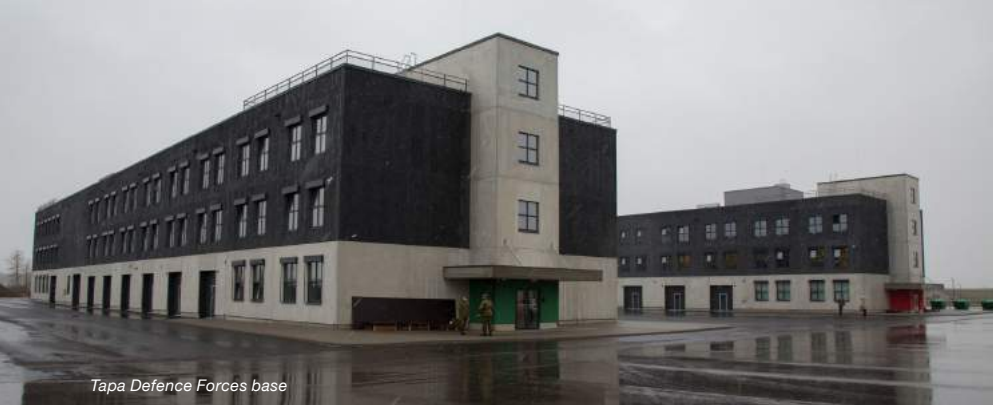
Tapa Defence Forces base