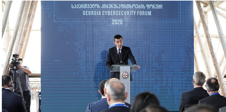
The first cyber security forum was organised by Georgia’s National Security Council, with the support of the government of Georgia.