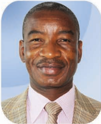
Hon. Nonofu E. Molefhi

Minister of Transport and Communications